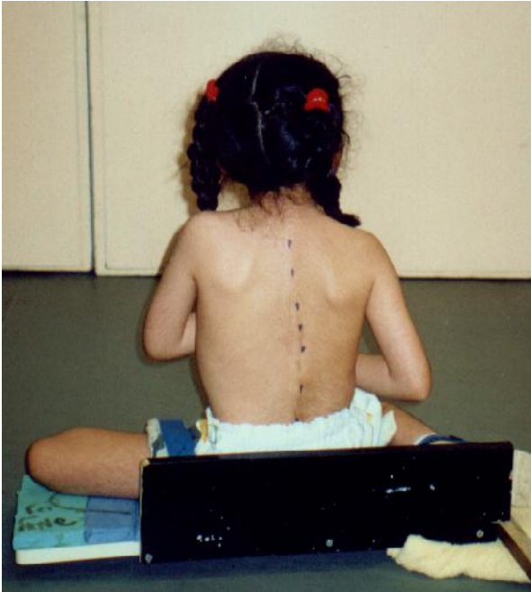
Photograph 2. A special seat.