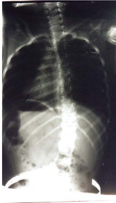
FIGURE 2. A follow-up X-ray, taken on July 18, 1999, in a suspended position showing 22° Cobb