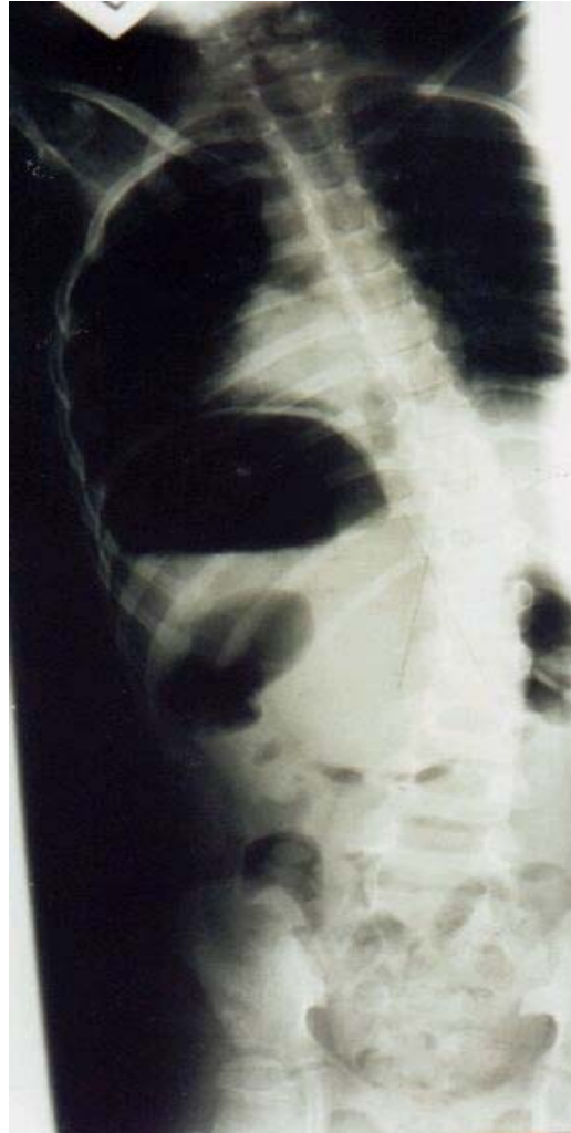
FIGURE 1. A 29° Cobb right C-shaped scoliosis taken in a supine position on August 2, 1998.

The rapidly advancing scoliosis made it necessary to take immediate intensive steps to develop a new management plan. The fact that 88% of females with Rett syndrome show an S-shaped scoliosis led the therapist to believe in their ability to correct the spine's tendencies (the belief was that the scoliosis started as C-shaped and the child's efforts to correct her posture will eventually cause her to end up with an S-shaped scoliosis). Physical examination showed that RC's equilibrium reactions (equilibrium reactions are those highly integrated complex automatic responses to changes in posture and movement aimed towards restoring balance and preventing falls with test administered according to Uyanik et al.[14]) were present and active in a seated position, but not quick enough to be considered efficient in fall prevention. The new intervention was based on the following principles (some are based on existing evidence, but most are new concepts):