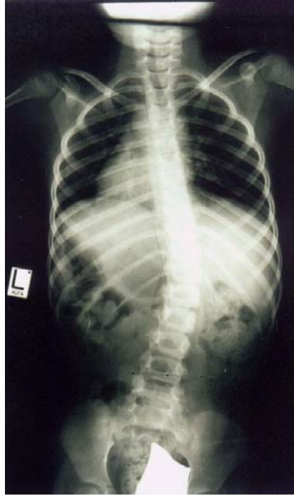
FIGURE 3. X-ray taken on February 16, 2000, in supine position showing 20° Cobb.

After a year and a half of intervention, two X-rays were performed (Figs. 3 and 4). Since the X-rays were taken at different dates and in different positions, an explanatory summarizing graph was added (Graph 1). The X-rays sets were evaluated by four experienced orthopaedic surgeons, who did not know the child and were blinded to the intervention procedure and the X-ray dates (see Table 2). Each evaluator was individually introduced to the four X-ray photos and asked to measure the Cobb angle[15]. The findings of the evaluators support the fact that the treatment produced positive results in reversing the course of the scoliosis.