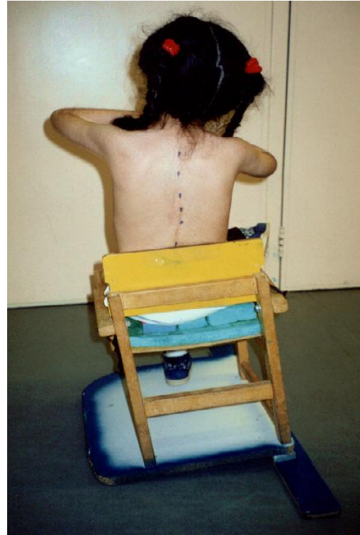
Photograph 3. A special chair.