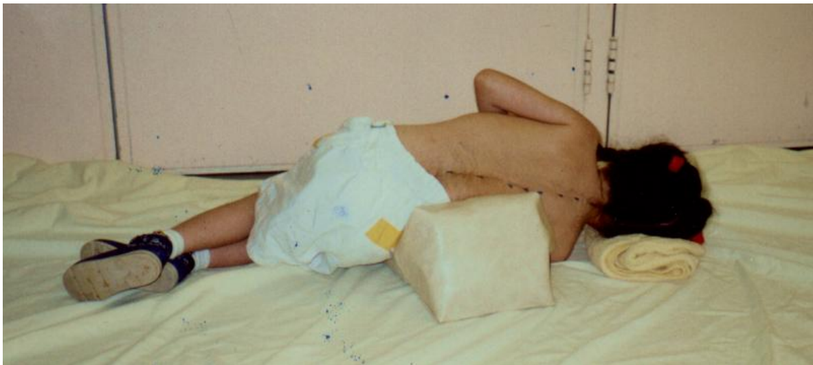
Photograph 1. A special cushion.

Implementing the program made it necessary to develop new and unique equipment such as a U-shaped pillow (to be used during sleep/nap times, see Photo 1), a special seat (see Photo 2), an adapted chair (see Photo 3), and an adapted standing frame (see Photo 4), all tilted forward and to the left, causing the child to use balance reactions by working asymmetrically — harder with the extensors and side flexors of the right side of her body — against the natural pull of the scoliosis. As mentioned earlier, the program was very intense and the child's weekly schedule included asymmetrical positioning throughout the day (9:00–15:00) except for meal times (see Table 1). It should be emphasized that the intensity of the program did not impede the child's educational curriculum.