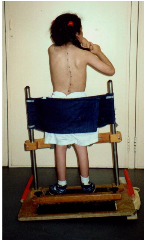
Photograph 4. A special standing frame.